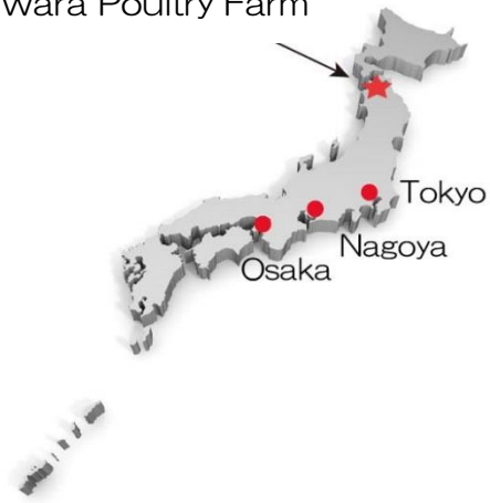
Fujiwara Poultry Farm