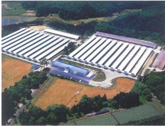
22 houses before renovation.