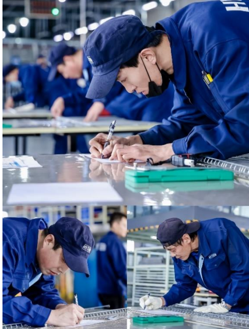
Program inputting to Welding Robot & Drawing reading Competition