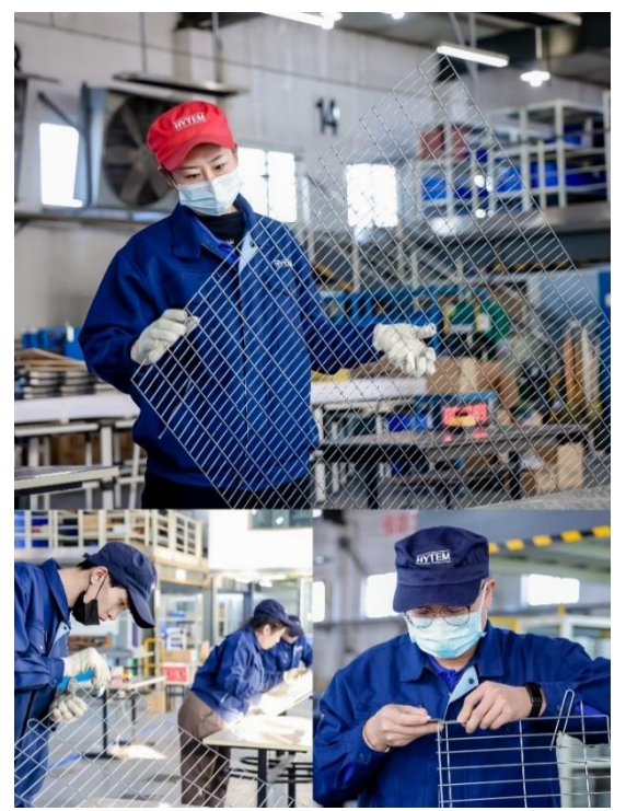
Cage mesh bending and QC(Quality Control) competition