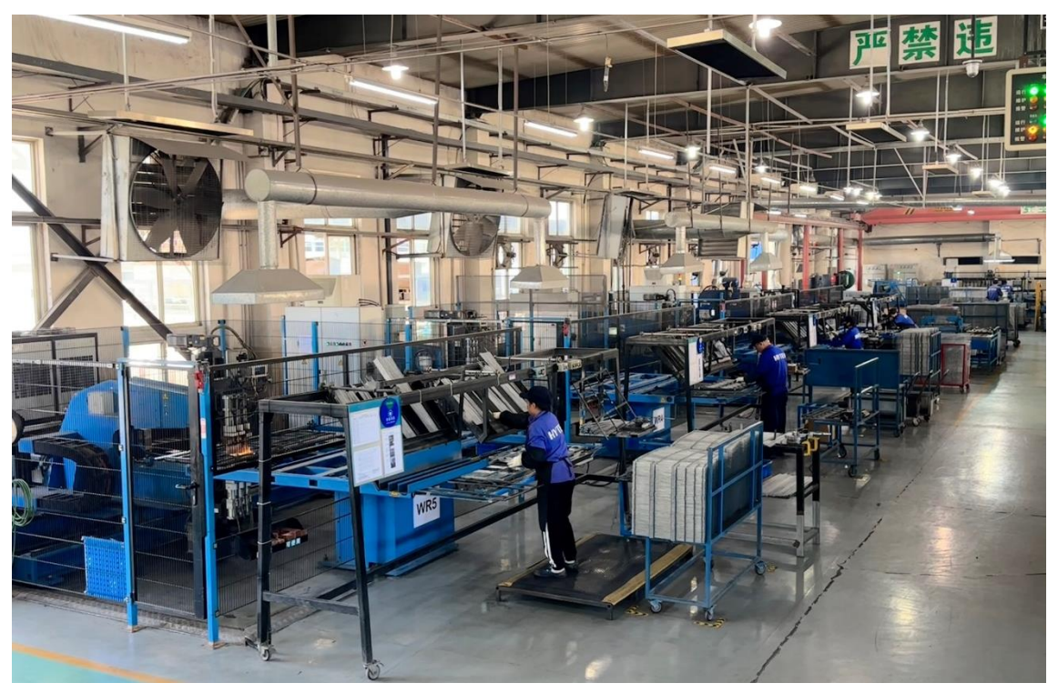
Cage Parts (Partition etc.) Robot Welding Line