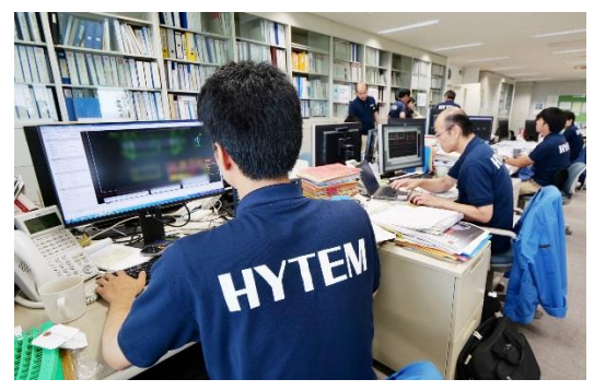
Hytem Headquarters Engineering Team