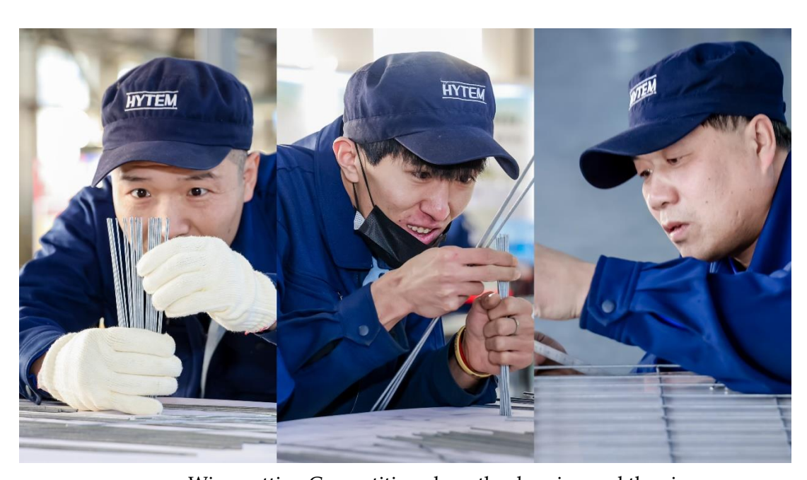
Wires setting Competition along the drawing and the zig