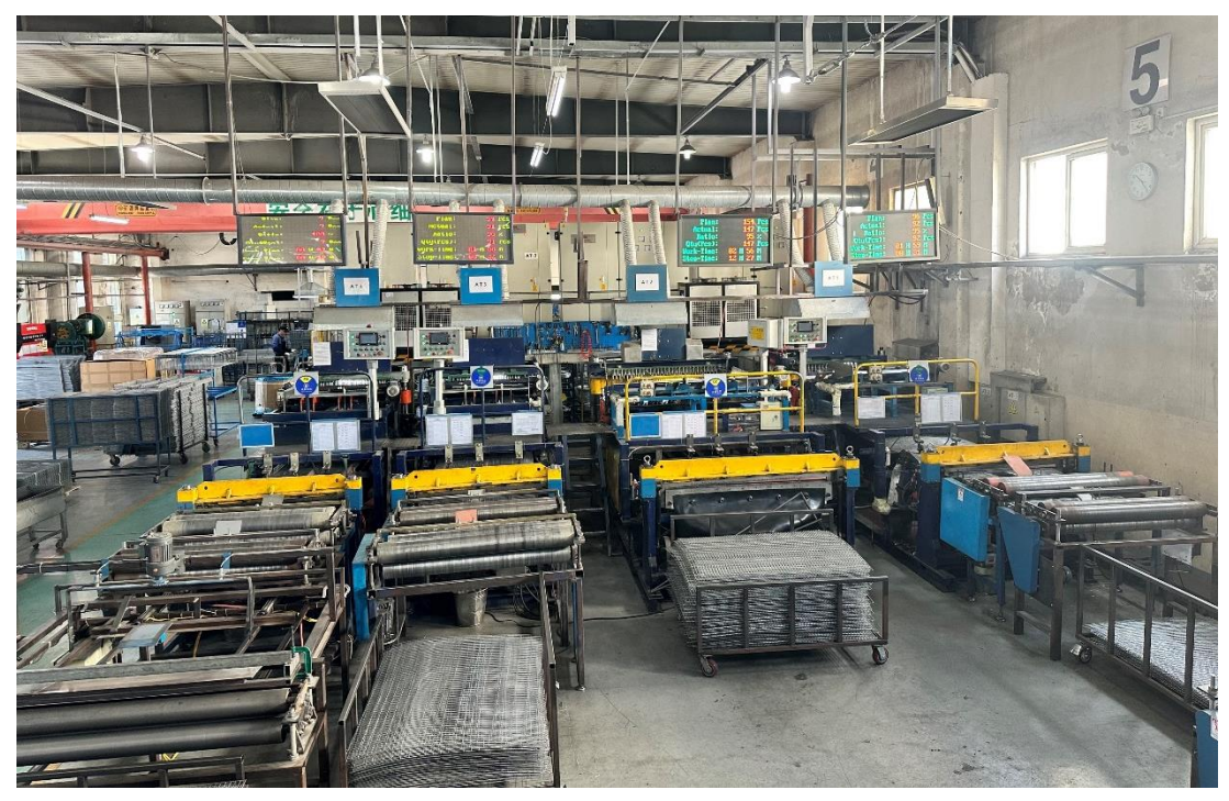
Cage Floor Automatic Welding Line

Cages, quality of which is critical for EFA durability, are all manufactured in Hytem Factory from 10% Aluminum galvanized wires under Hytem standards.