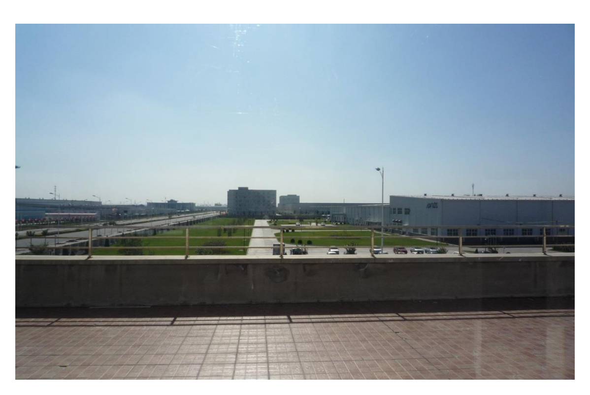
Located in Beichen Hitech park