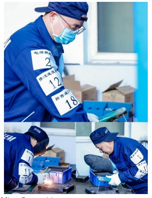
Packing, Delivery & Welding Competition