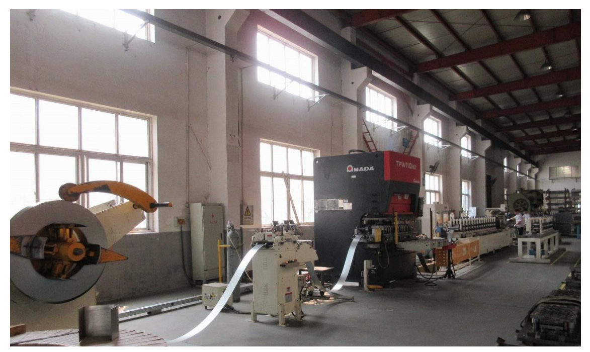
Automatic Sheet metal Forming Line

Automatic manufacturing is enhanced for the stable Quality Control, and minimizing the labor cost