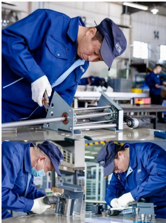
Folk lift driving and Assembling Competition