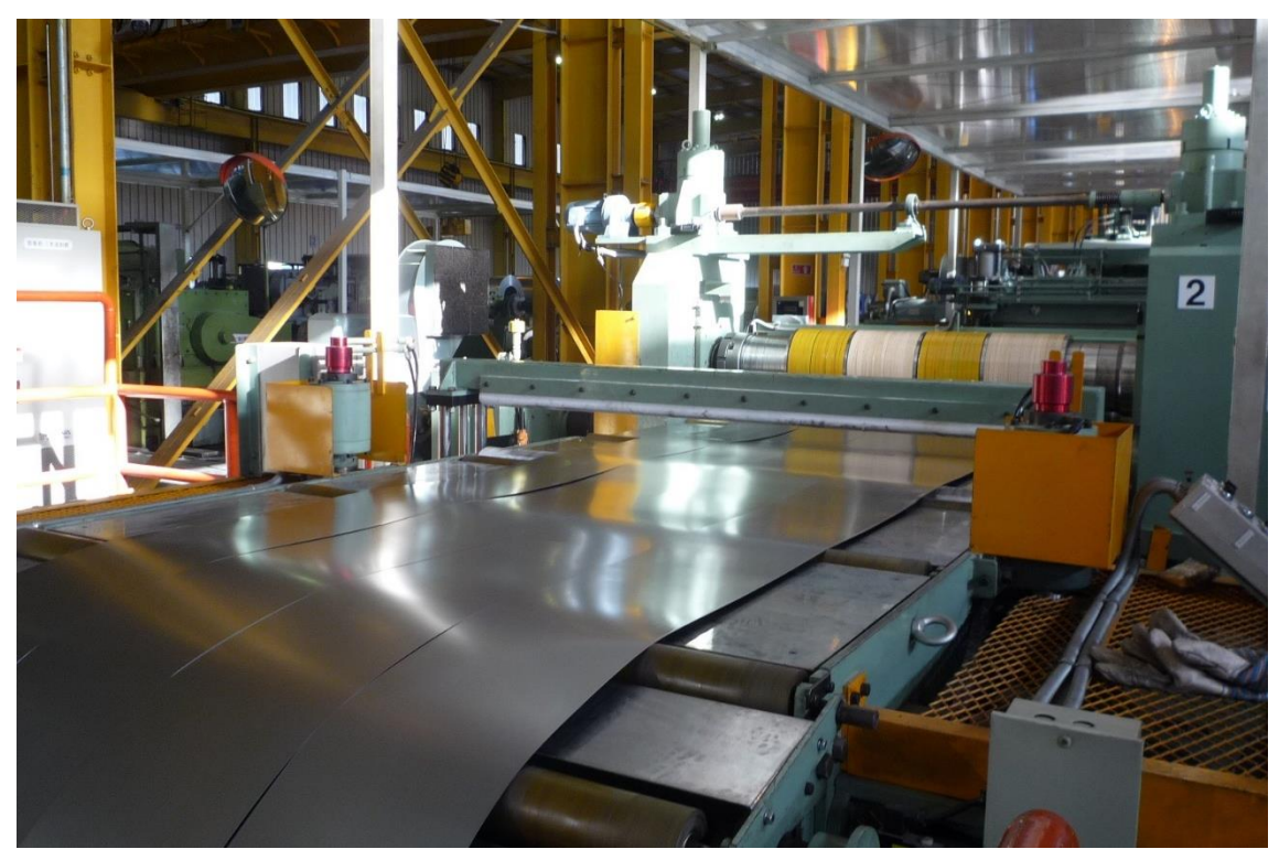
The main sheet metal supplying factory(Roll Center) for Hytem Factory Metal One Tianjin Roll Center(Japanese company)

Quality Control is the important manufacturing process at Hytem Factory