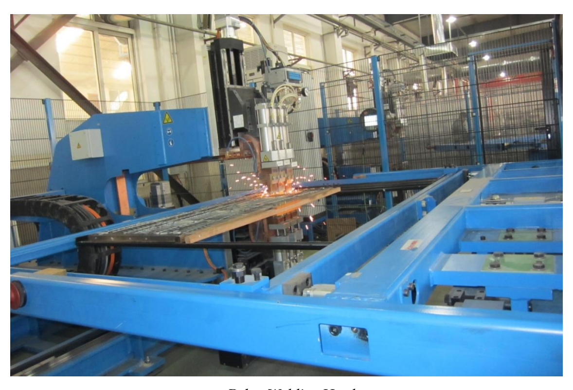
Robot Welding Head