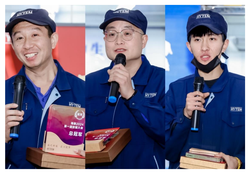
Gold, Silver and Copper Winners(Left to Right)