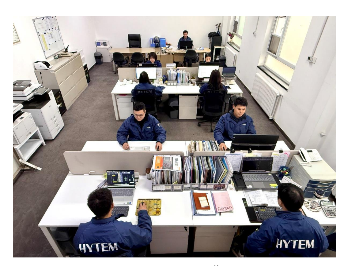
Hytem Factory Office