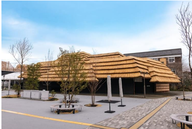
The Earth Mart pavilion

To produce eggs, EFA/Egg Farm Automation is essential.